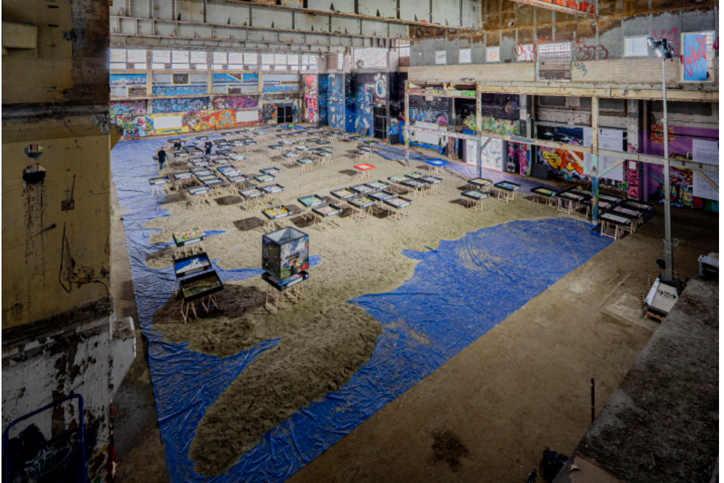
Overview of the exhibition by Ministerie van Maak and IABR.