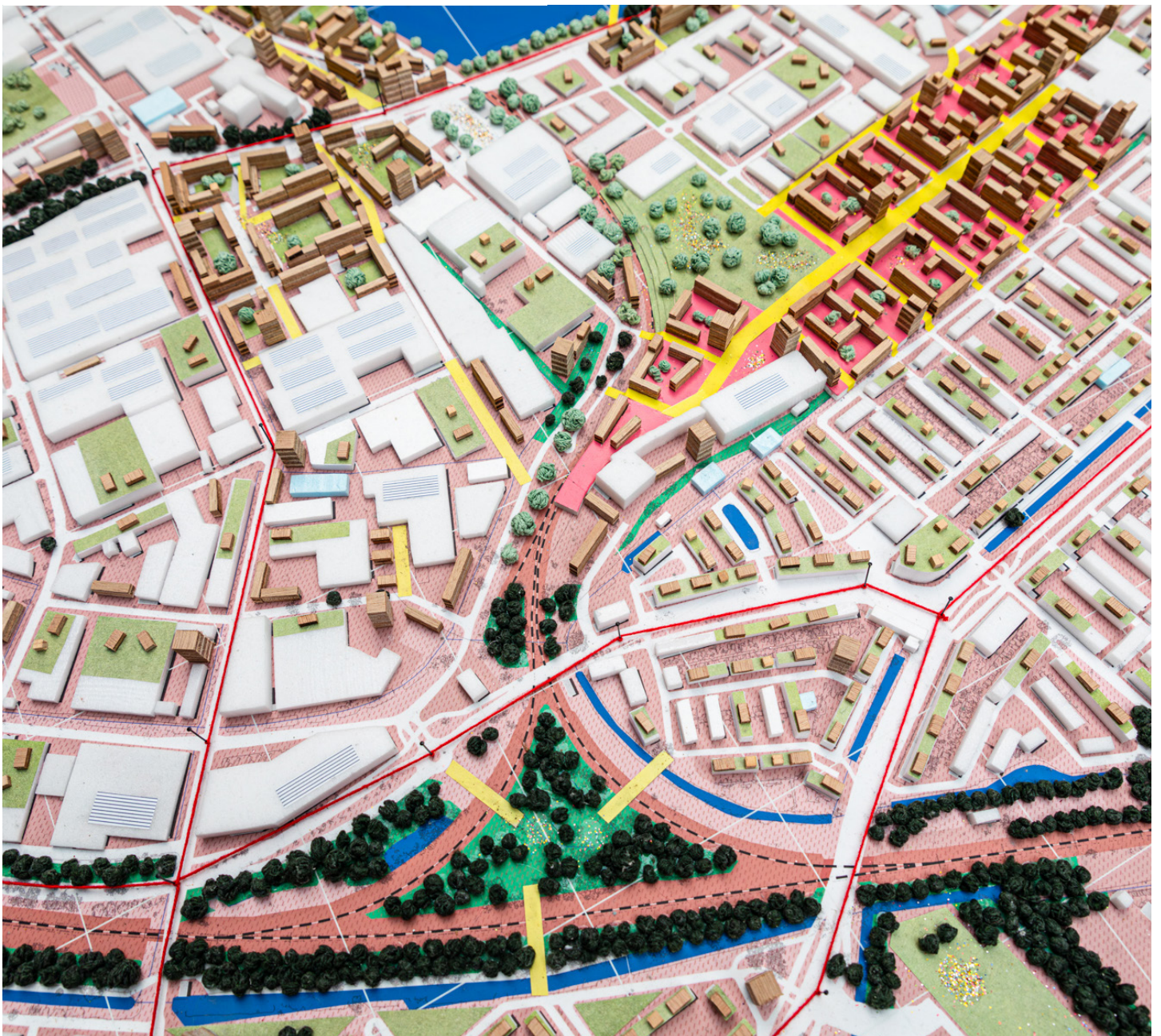
Close-up of the model.