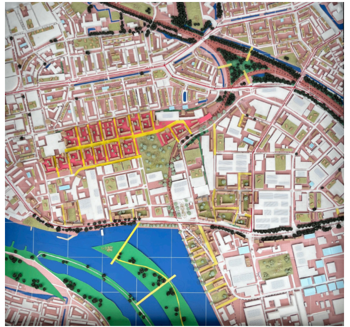
Top view of CITYFÖRSTER's Model.