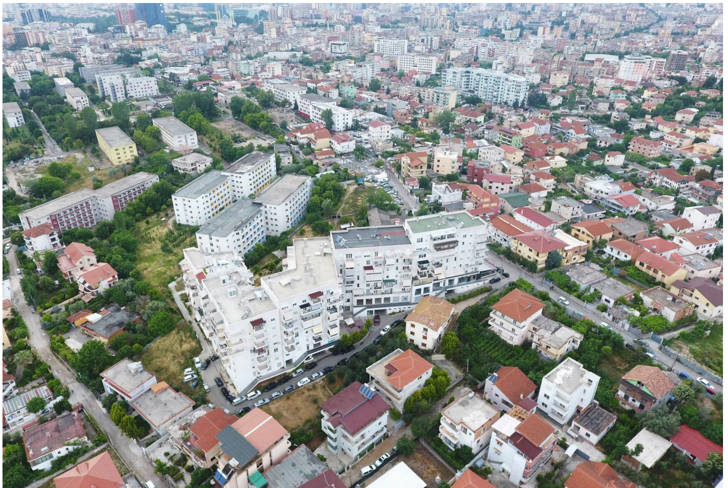
drone shot of ANA residences, 2021.