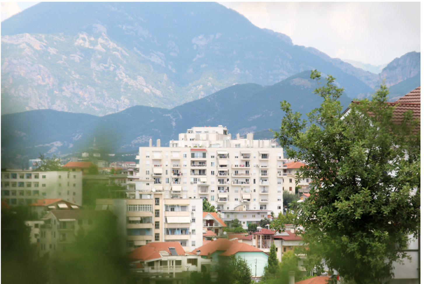
ANA residences from the distance, 2021.