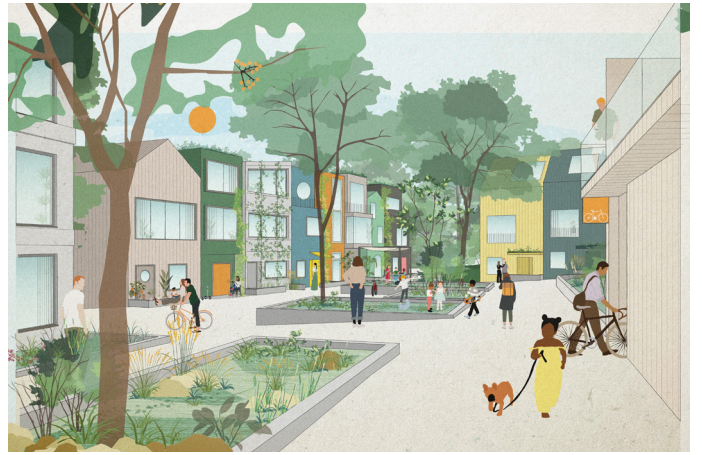
The neighborhood court as a meeting point