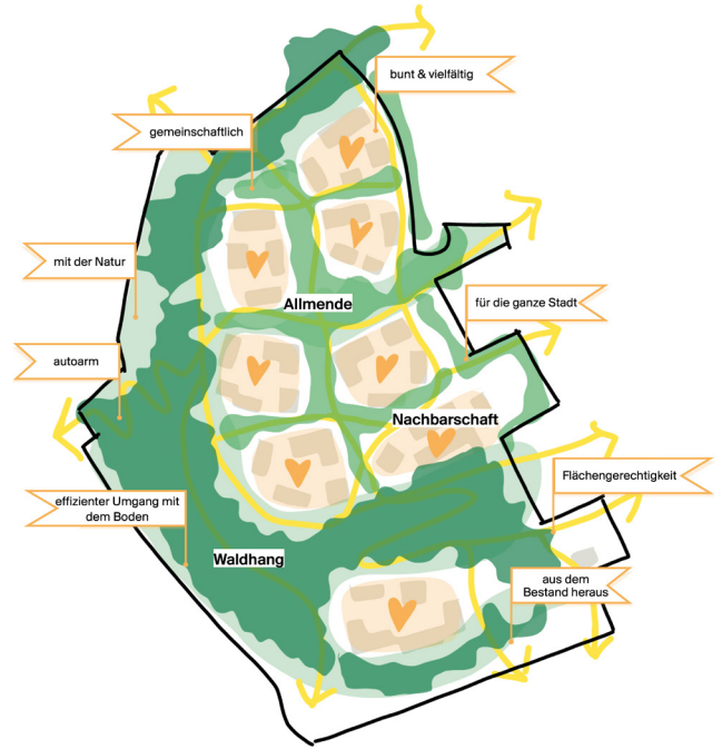
Concept sketch: New neighborhood at Hirschberg

At the center of each island is a car-free meeting place for residents, while the private gardens are oriented towards the outside. The communal open space offers play areas, meeting points and public green areas. The adjacent wooded slope remains largely natural and offers space for vegetation, orchards and wildflowers as well as a picturesque view of the surrounding area. This innovative residential concept is intended to provide a sustainable and social response to the housing needs of the city of Biberach by creating diverse, green and community-oriented living options in a central location.