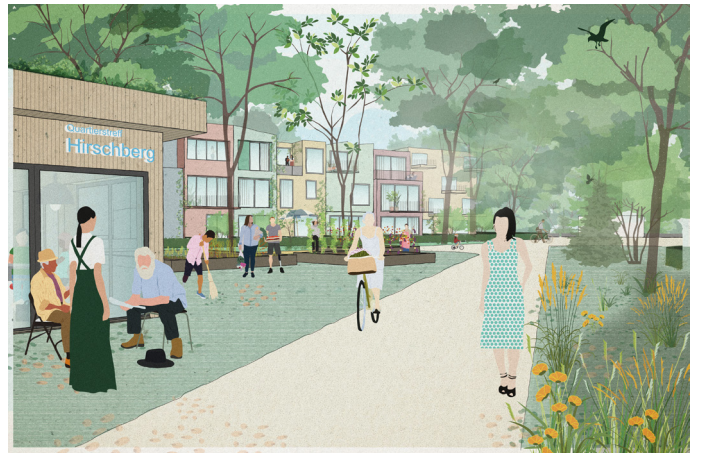
The neighborhood center in the commons