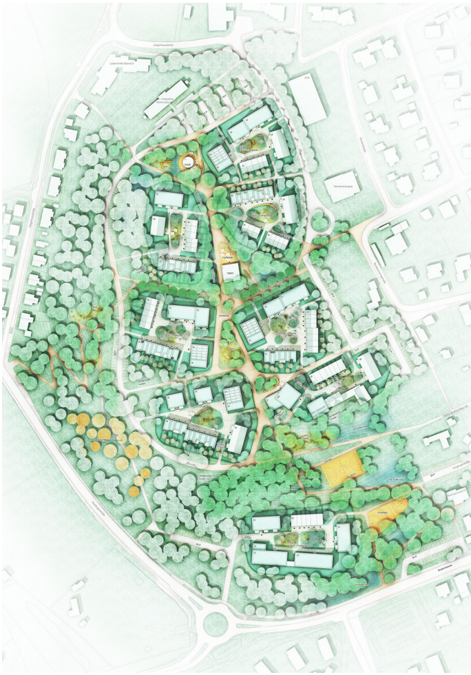
Floorplan: the commons connect the neighborhoods