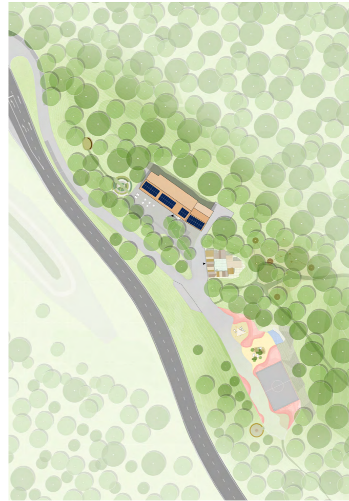
The new masterplan activates the terrain and creates multifunctional spaces