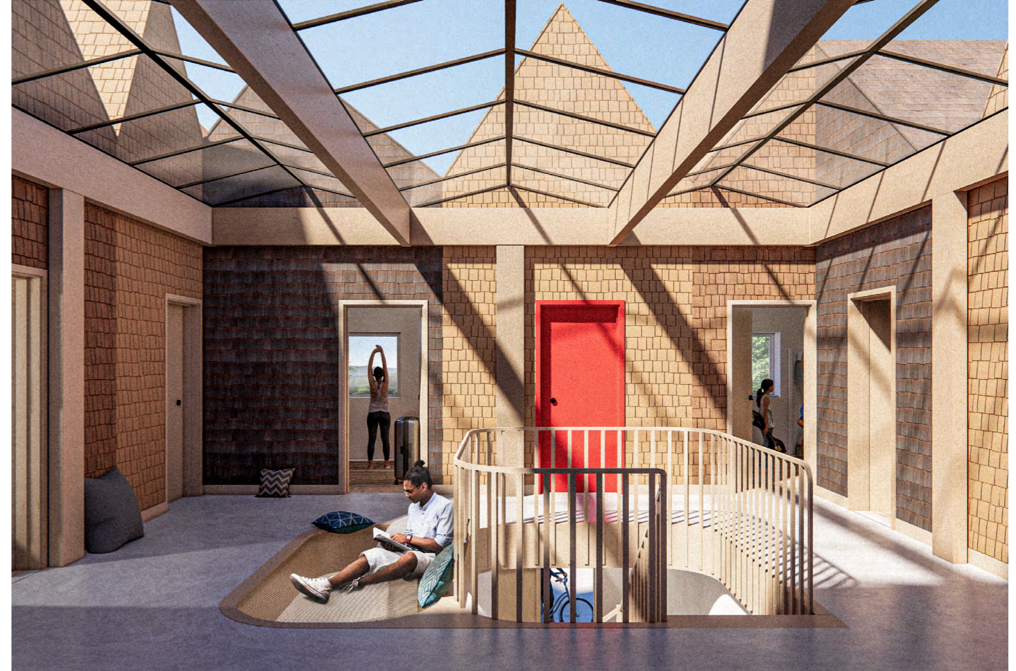
Lively atrium in the new summer house