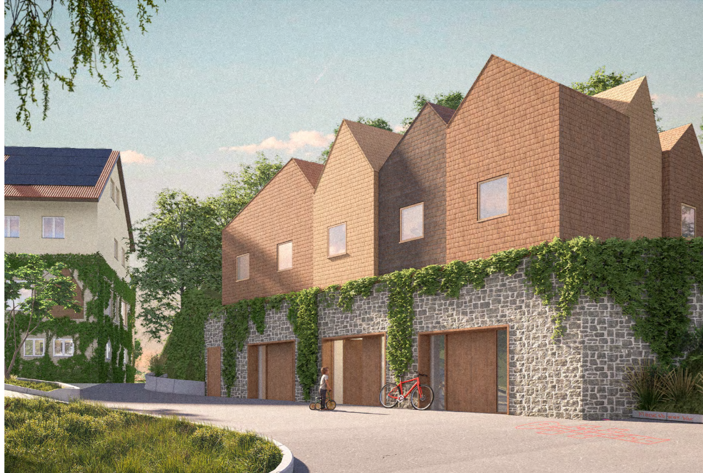
Arrival at the youth hostel. The summer house is the eyecatcher of the circular concept, with recycled wood, window frames and construction components

The renovation focusses on the Space Plan and Services of the building. The circulation is reconfigured to fit in an elevator.