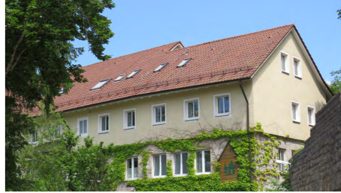
Youth hostel existing building

The beautiful location of DJH Lochen provides an inspiring natural environment. The outdoor facilities are upgraded, and new functionalities are added to extend the possibilities for outdoor activities. The multifunctional outdoor spaces contribute to the sustainable outdoor experience of DJH Lochen.