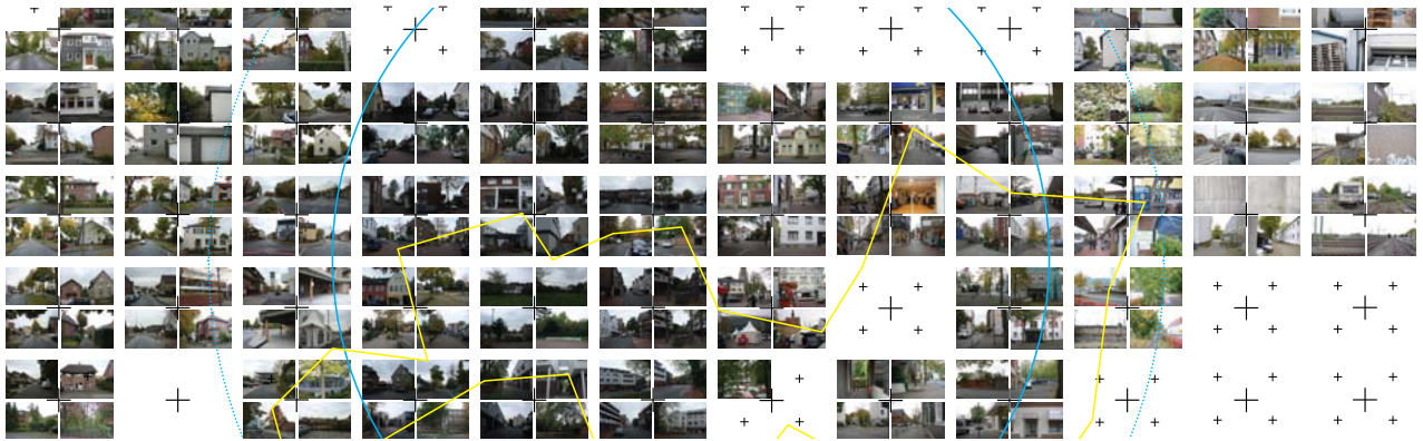
Analysis of spatial potentials