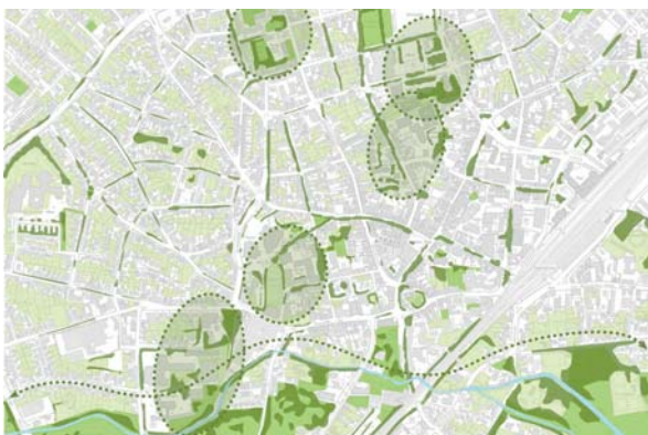
Potential map: urban open space structure