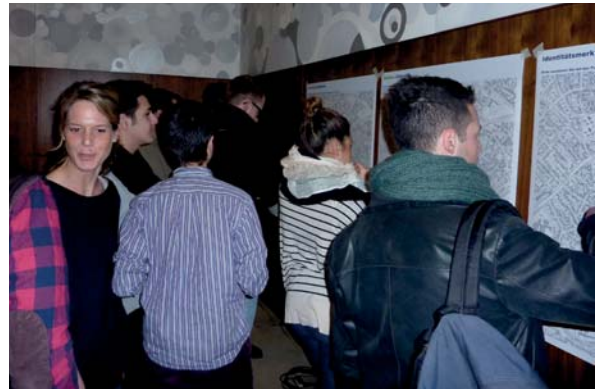
Participation process: Public Information