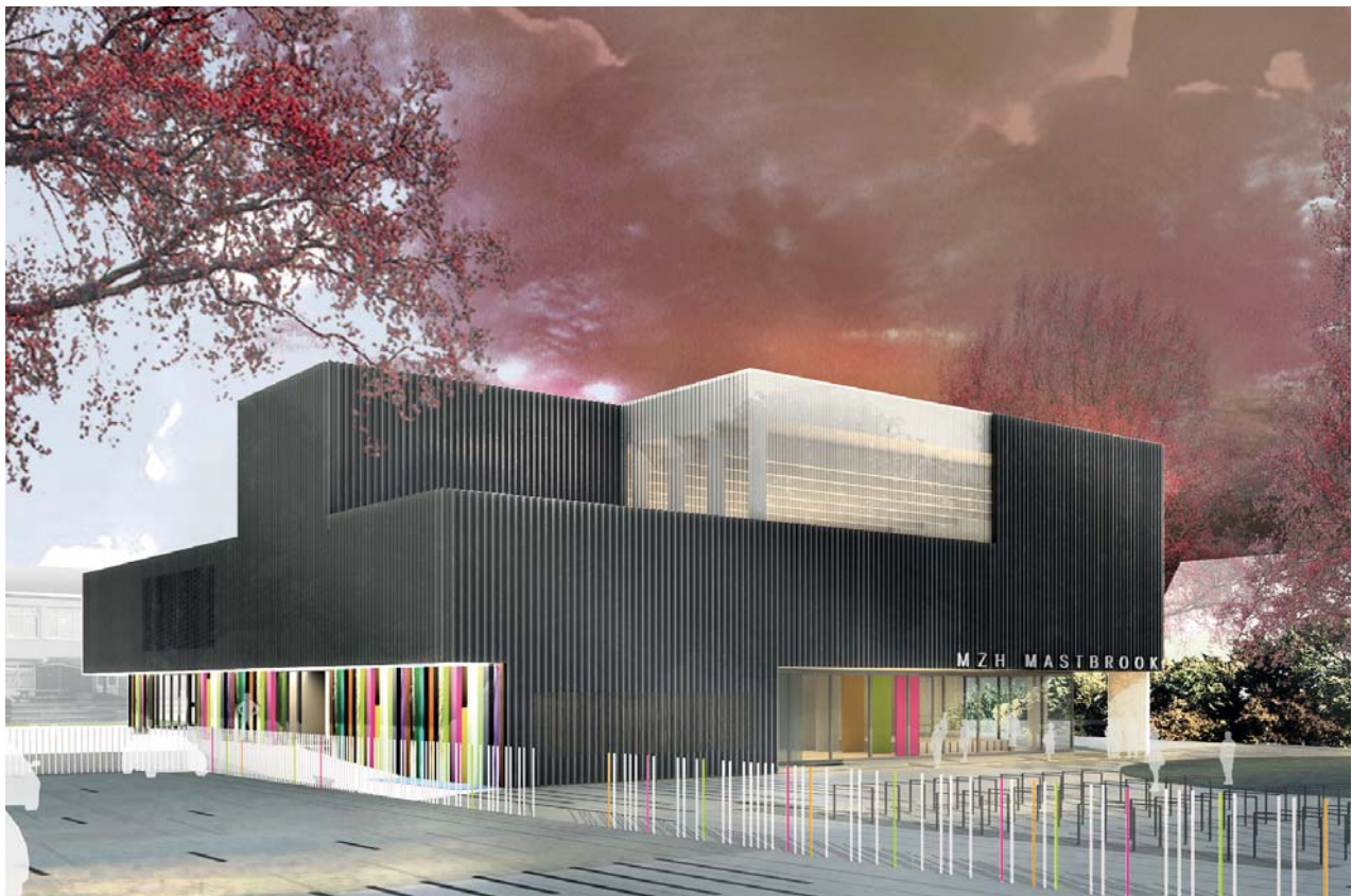
Arriving at the District Centre